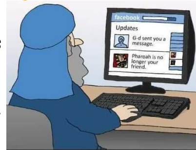
Moses on the Web

Both make the "TZ" sound, but final tzadi is only found at the end of a word.